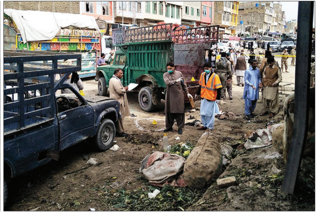
List of victims of the individual and targeted killings of Hazaras and Shiites of Baluchistan, Quetta (3)